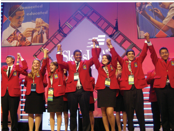
PHOTO COURTESY OF CRAIG MOORE, SKILLSUSA, 2011 NATIONAL LEADERSHIP AND SKILLS CONFERENCE.